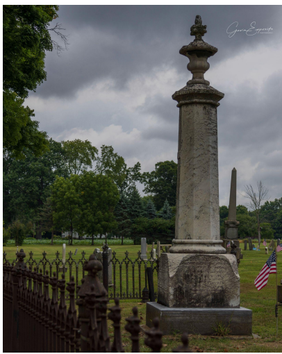
Enclosed by a stylish but rusted Gothic fence, the Kinsman monument towers over the Presbyterian Churchyard, ensuring prominence in the community, even in death.